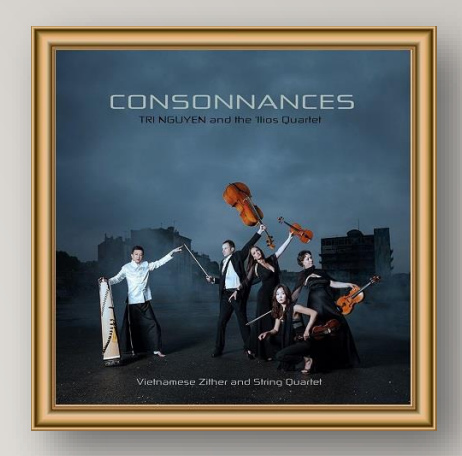
EP & SINGLES